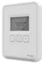
LCD with Buttons